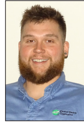
Manager of Safety & Loss Control