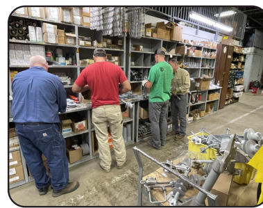
Pulling materials in the warehouse.

Normally, the warehouse staff would pull the needed materials for the linemen on the morning of the job. In this case, however, a line crew came in the day before to pull the materials so they could leave the shop as soon as possible the next morning.