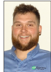
Manager of Safety & Loss Control