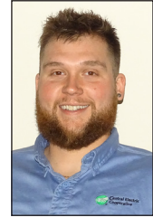
Manager of Safety & Loss Control