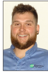
Manager of Safety & Loss Control