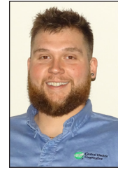
Manager of Safety & Loss Control