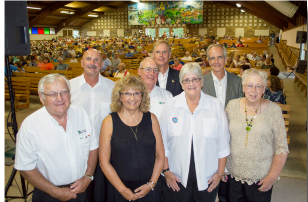
CEC's Board of Directors