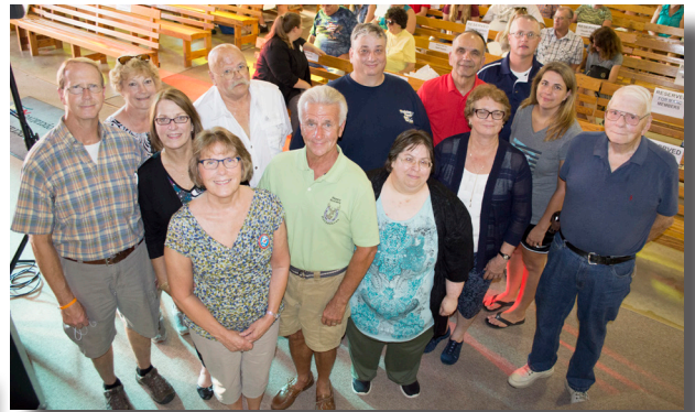
2016-2017 Member Aware Advisory Committee (MAAC)