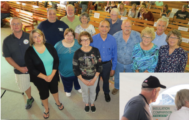
2016-2017 Member Aware Advisory Committee (MAAC)