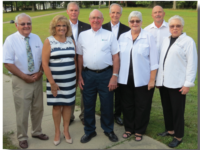
CEC's Board of Directors