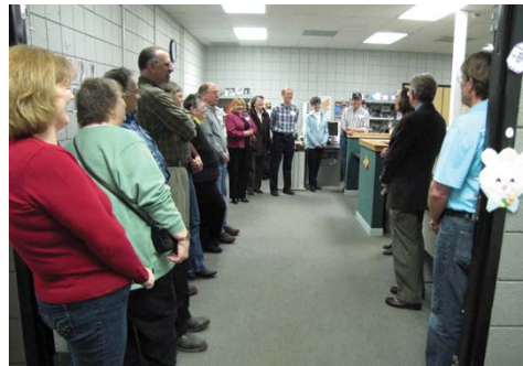
2010-2011 MAAC committee tours CEC headquarters

Also new to Central Electric is our 2010-2011 Member Aware Advisory Committee (MAAC). This committee reiterates our commitment to you, as members, and our ability to establish effective communication between the members, board of directors and management at the cooperative. The MAAC committee plays an important role in the grassroots development and implementation of many cooperative programs. The committee members are involved in evaluating cooperative policies,