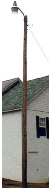
100-Watt HPS Yard Light

The most popular light we offer is the 100-Watt high pressure sodium (HPS) Yard Light. This luminaire has a circular lighting distribution and works best for general area lighting in yards, on the farm