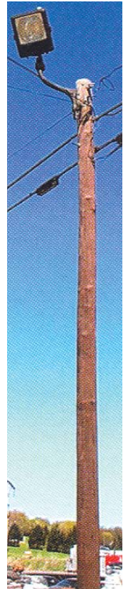
400-Watt HPS Floodlight

For more information on how to take advantage of our lighting program call 800-521-0570 or visit www.central.coop and have one installed today. There is usually no installation charge and it only takes a few days to install. And remember, you never have to maintain a CEC light.