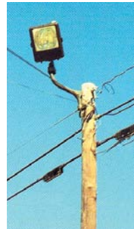
400-Watt Metal Halide Floodlight

The cooperative is also keeping up to date with new technologies. We are currently testing Light Emitting Diode (LED)