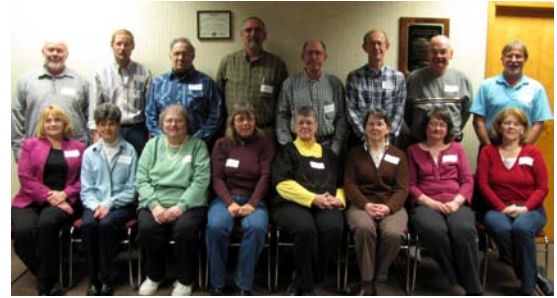
CEC's 2010-2011 MAAC Committee