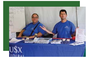
U$X Federal Credit Union