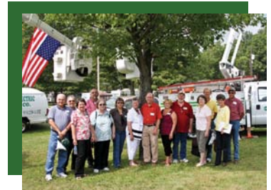
CEC's 2010 – 2011 MAAC committee