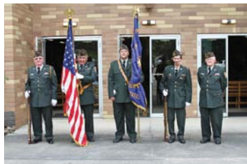
Parker Post 7073