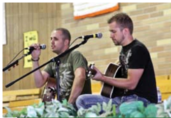
Burning Daylight band