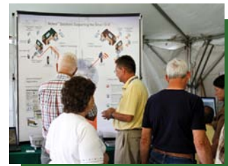
Members learn about load management