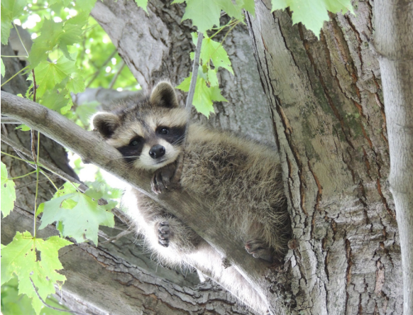
First Place: Hanging Out

Thank you to everyone who participated in our 2014 Photo Contest! We started with 35 entries and with the help of all of you voters, the three winning photos have been determined. Watch for information on our 2015 Photo Contest in your spring 2015 Power Lines newsletters!