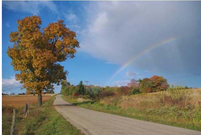
First Place: A Beautiful Day in PA

A big thank you to everyone who participated in our 2013 Photo Contest! We started with 24 entries and with the help of 782 voters, the three winning photos have been determined. Also, watch for information on our 2014 Photo Contest in your spring 2014 Power Lines newsletters!